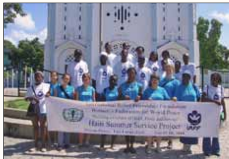
Service Trip to Haiti - June 15-29, 2009