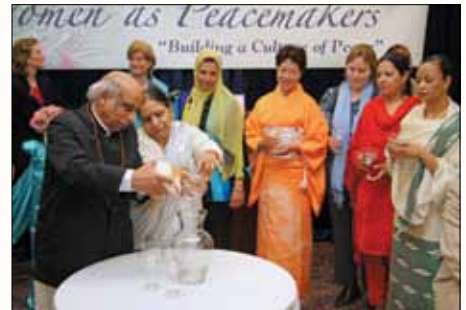
International Women's Day, Washington DC