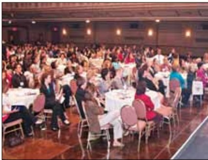
17th WFWP Anniversary National Assembly, September 18-20, 2009 - New York City