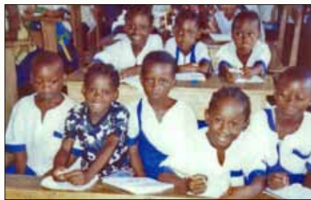
WFWP Sponsored School in Equatorial Guinea