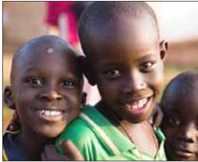
WFWPI is a 501(c)3 Non-Profit Organization

For more information about projects, see Biennial Reports at www.wfwp.org