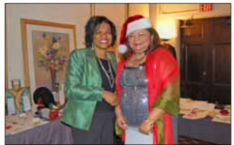
Benefit for the Schools of Africa, Silent Auction in DC