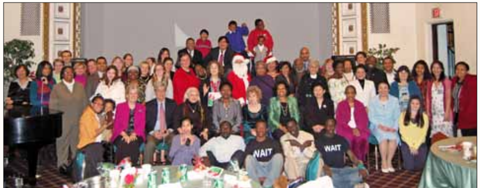
Benefit for the Schools of Africa, WFWP Chapter in Washington DC