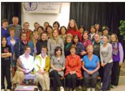
Monthly Meetings of Chapters Nationwide, Seattle