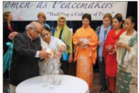
International Women's Day, Washington DC