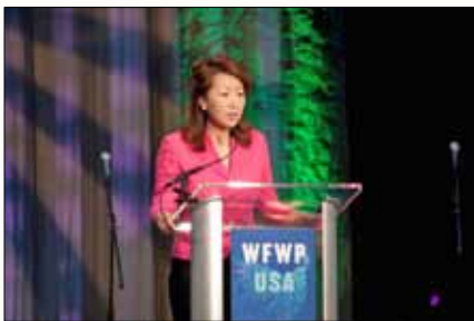
Rev. In Jin Moon addressing WFWP National Assembly